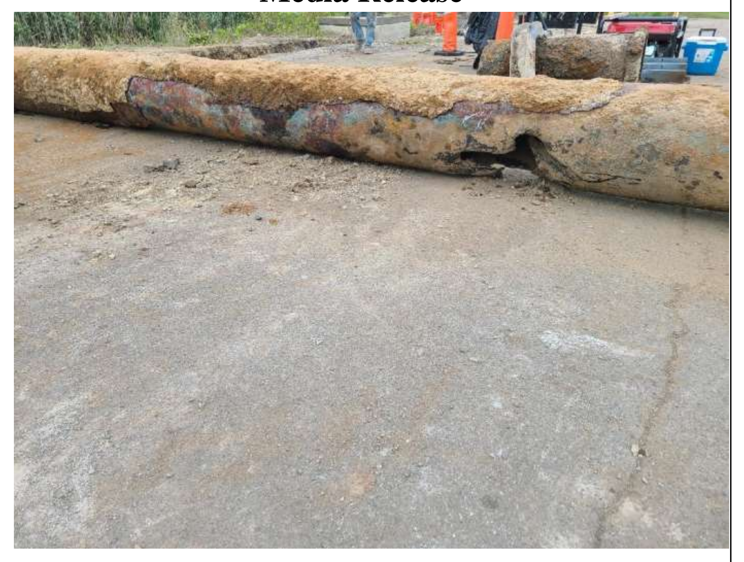
Existing 31-year-old pipe