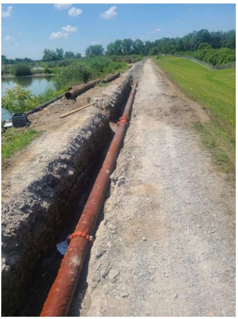
Newly installed pipe with corrosion resistant wrap and high temperature gaskets.